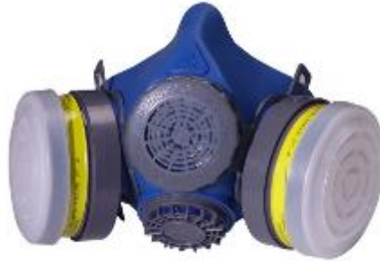
Half-face Air Purifying Respirator with N95 particulate filters