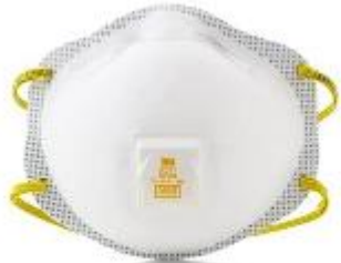
Disposable Filtering Facepiece N95 Respirator

For example if the label requires minimum of a Disposable Filtering Facepiece N95 Respirator (photo on lower left):