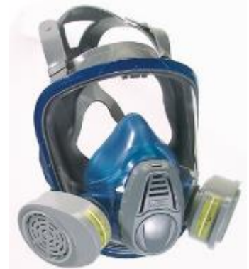
Full-face Air Purifying Respirator with N95 particulate filters